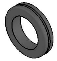
ALL OTHER SIZES