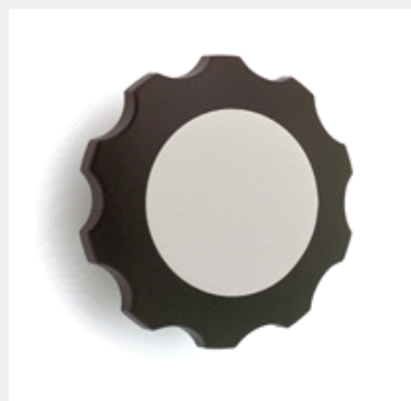
Application example on VHT. lobe knob

CP-XX covers are suitable for closing the indicator housing when the indicator is not required.