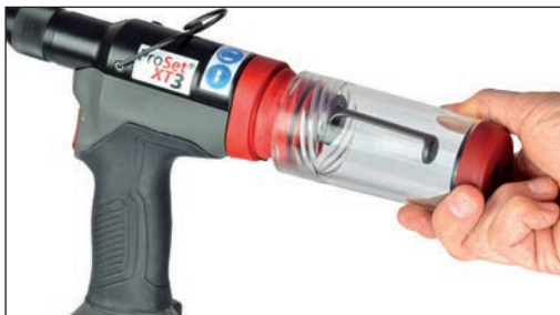
Quick release Mandrel Collection System MCS

The POP Avdel ProSet® XT tool line has many innovative high performance features including a patented "Quick Disconnect" nose housing and jaw case for rapid cleaning and maintenance of the front end without the need for any tools. The quick disconnect Mandrel Collection System (MCS) safely collects spent mandrels for quick, easy disposal and cleaner work areas. An air-isolation switch on the MCS prevents air flow when the MCS is disconnected. A left or right 90° swivel air fitting ensures the tools can be adapted to virtually any workstation configuration, while the "on/off" switch minimises air consumption and noise.