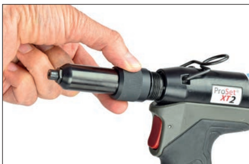
Quick disconnect nose housing and jaw case (without tools)