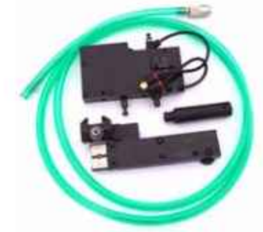
Shuttle Standoff Set