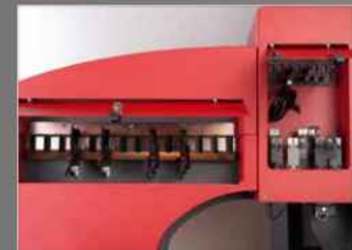
C: INTEGRATED TOOLING STORAGE