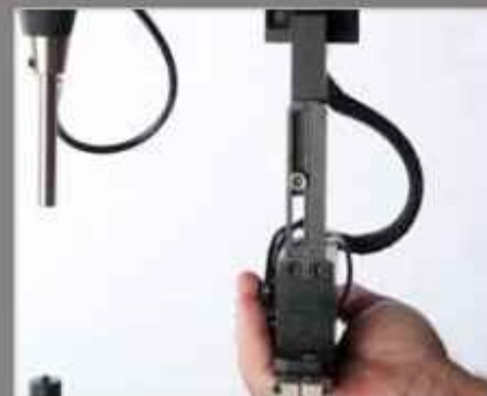
B1: NEW T-BRACKET AND SHUTTLE with integrated Connectors eliminating alignment challenges