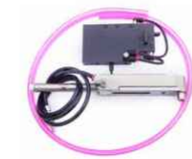
ABFT Set (Auto Bottom Feed)