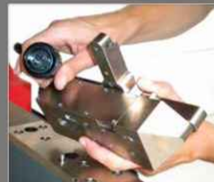
B2: PRE-ALIGNED LOWER TOOL HOLDERS Alignment pins allow for changeover to any other standard Haeger tool holder without alignment verification