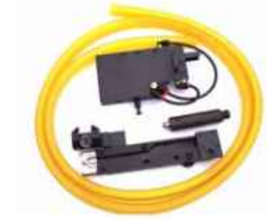
Shuttle Nut Set